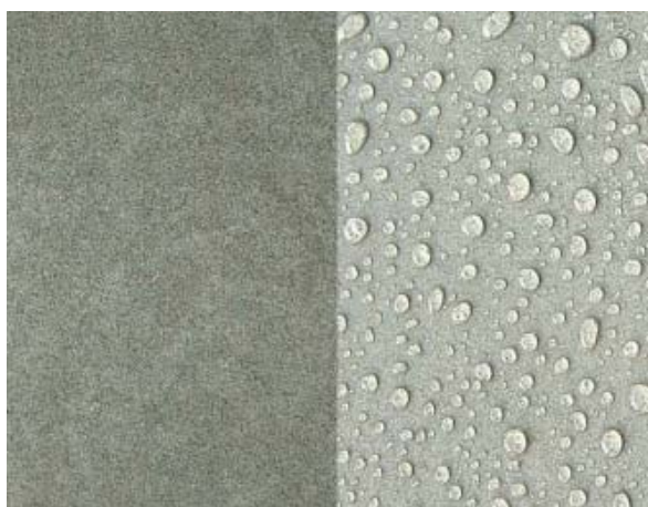
Concrete protected with Contite 40