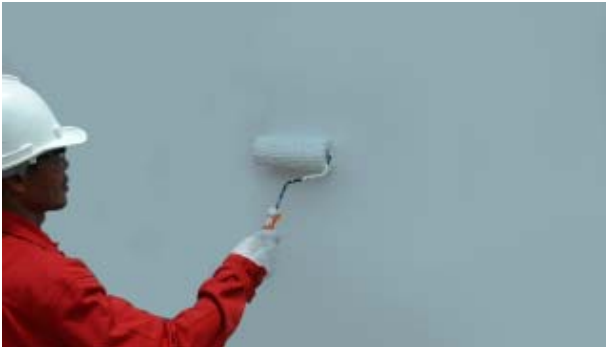
Application of Elastoclad by Roller

The application using brush or roller requires laying the material onto the surface, avoiding brushing out, to achieve the required film thickness per coat. A minimum of two coats are required on vertical surfaces to achieve a total dry film thickness of approximately 350 microns. On horizontal surfaces a minimum of three coats are required to achieve a total d.f.t. of approximately 500 microns.