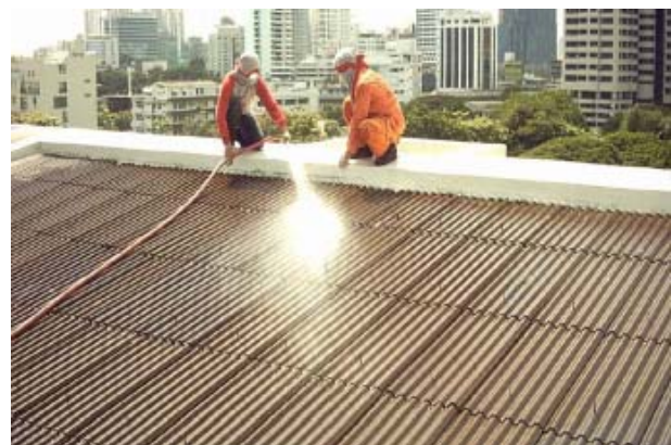
Application of Elastoclad by Spray

Spraying by airless spray is preferred over flat surfaces, a heavy to medium nap roller can be used and brush or roller for touch up or detail work.