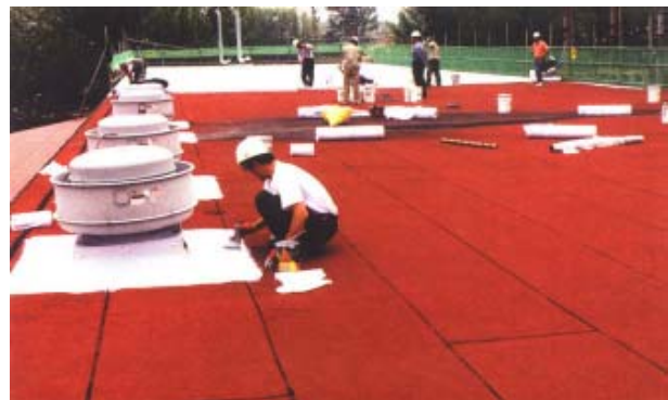
Elastoclad applied over existing roof membrane system.

Elastoclad can be applied over built up & modified bitumen roofs, cracked and deteriorated concrete roofs, steel roofs and single ply membranes such as EPDM, Hypalon, PVC, Neoprene etc. Ensure moisture movement is sealed off.